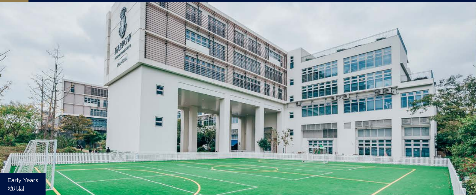
Early Years 幼儿园