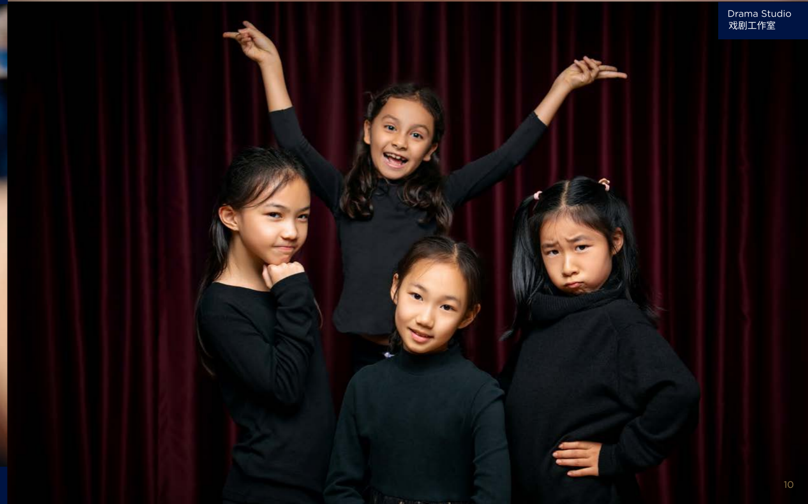
Drama Studio 戏剧工作室