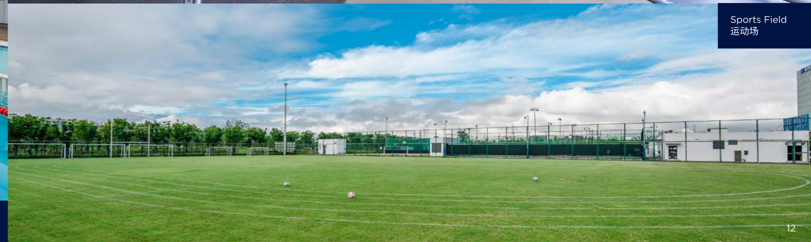
Sports Field 运动场