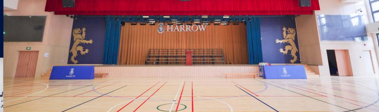
Sports Hall 体育馆