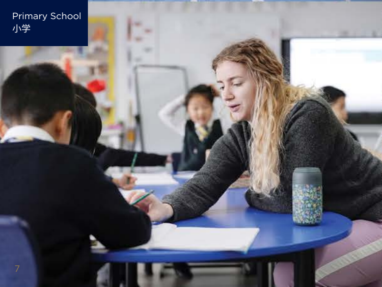
Primary School 小学