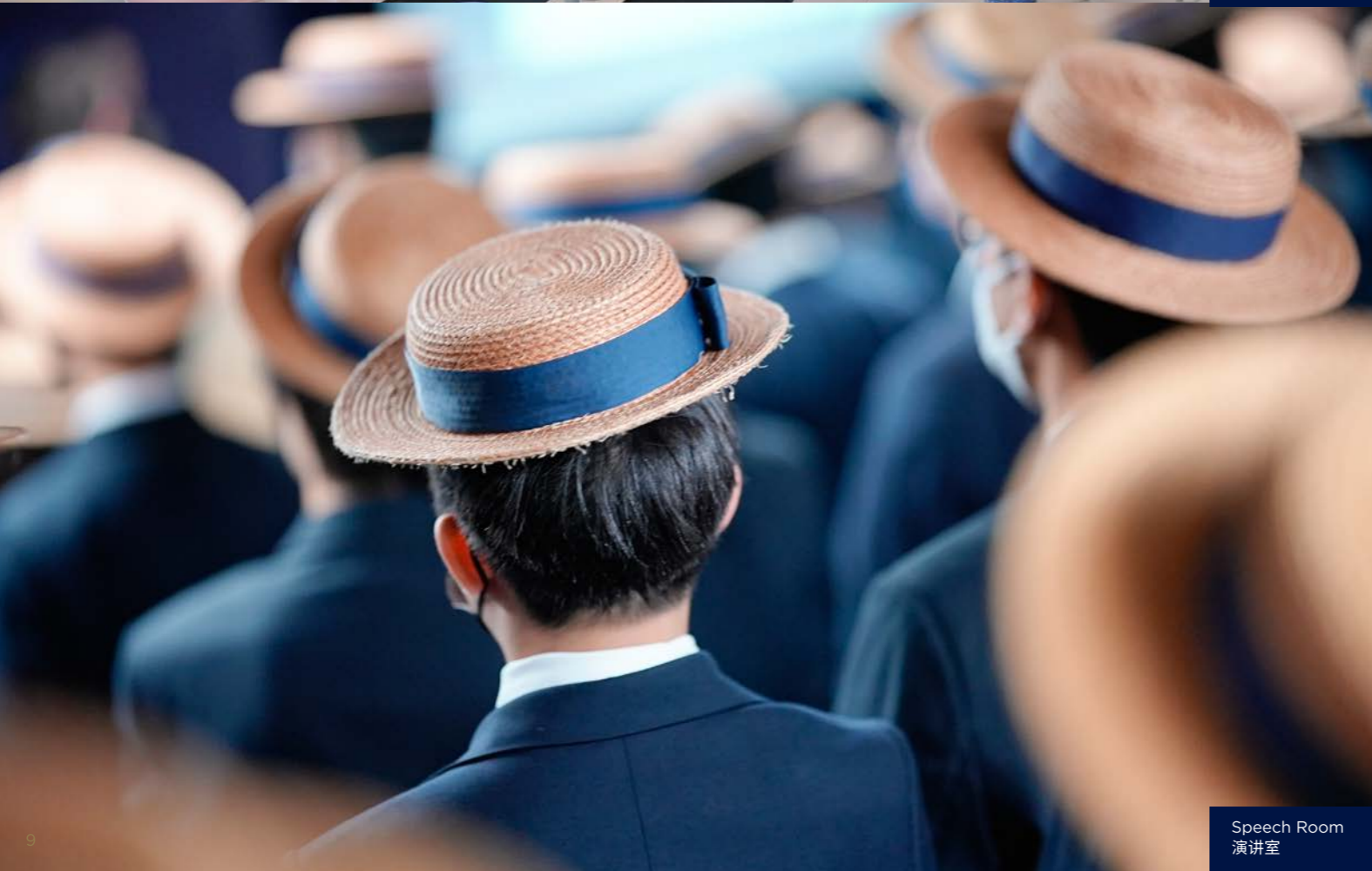
Speech Room 演讲室