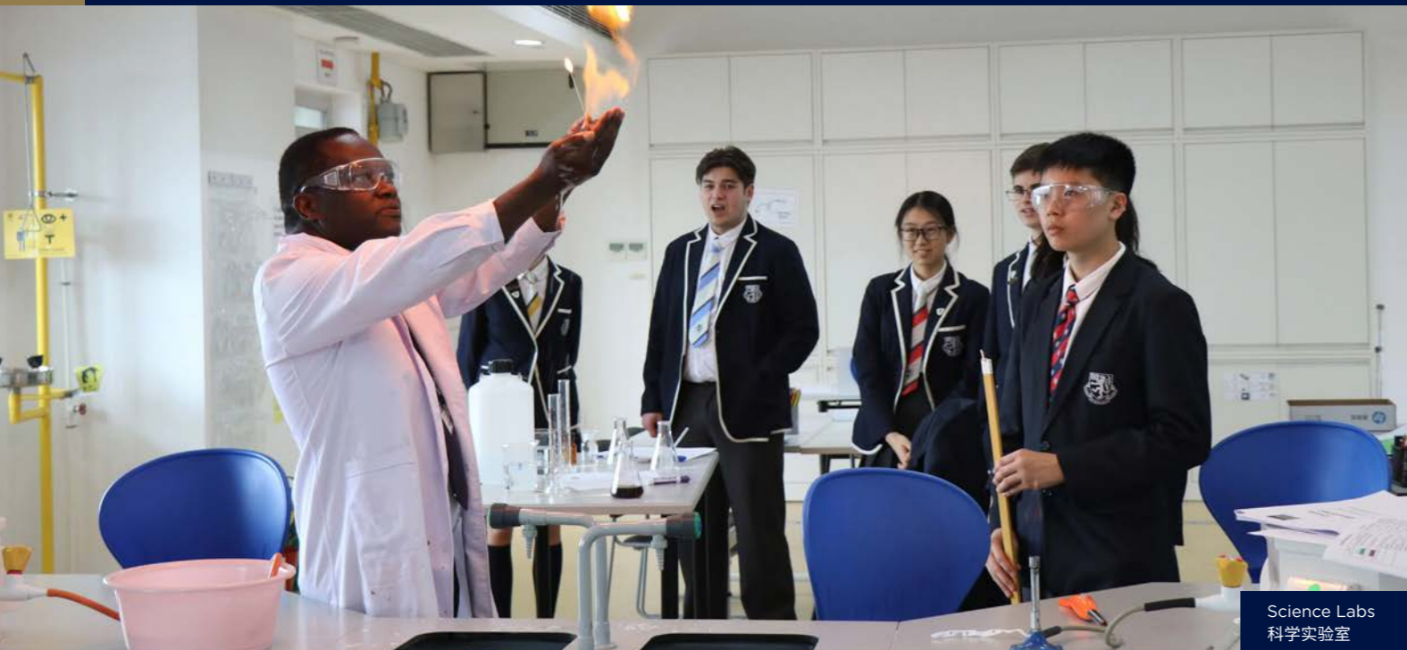
Science Labs 科学实验室